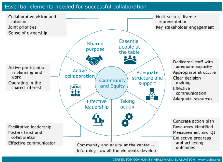
Figure 3. Essential elements needed for effective collaboration, the Hearts of Sonoma County Initiative, Sonoma County, California. Abbreviation: QI, quality improvement.

Details about the evolution of the collaborative structure and process, as well as successes, challenges, and lessons learned, were gathered through document review and interviews with 8 key participants. The data gathering was organized using a framework developed by the Center for Community Health and Evaluation (CCH) to track key elements in coalition development (Figure 3).